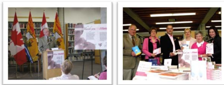
Collection Launch, May 8 th , 2009