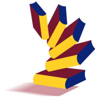
New Brunswick Public Libraries Foundation

The New Brunswick Public Libraries Foundation promotes the public library system, fundraises and provides resources supporting fundraising. The activities of the Foundation will result in increased financial support for the public library service.